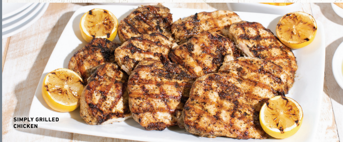
SIMPLY GRILLED CHICKEN