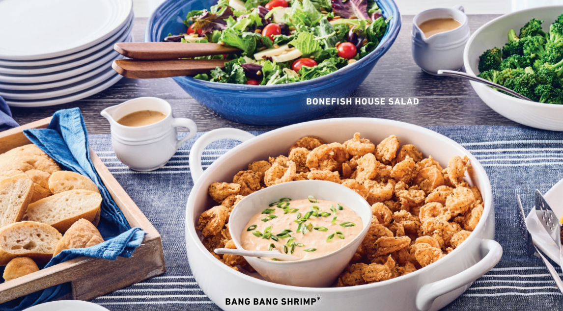
BONEFISH HOUSE SALAD